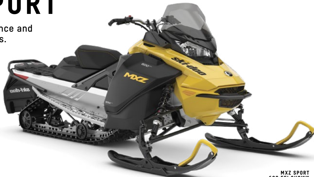
MXZ SPORT 600 EFI SHOWN

Dynamic trail performance and value-oriented features.